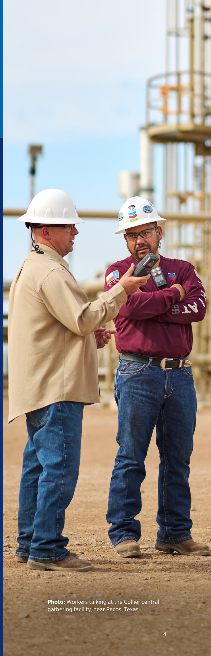
Photo: Workers talking at the Collier central gathering facility, near Pecos, Texas.