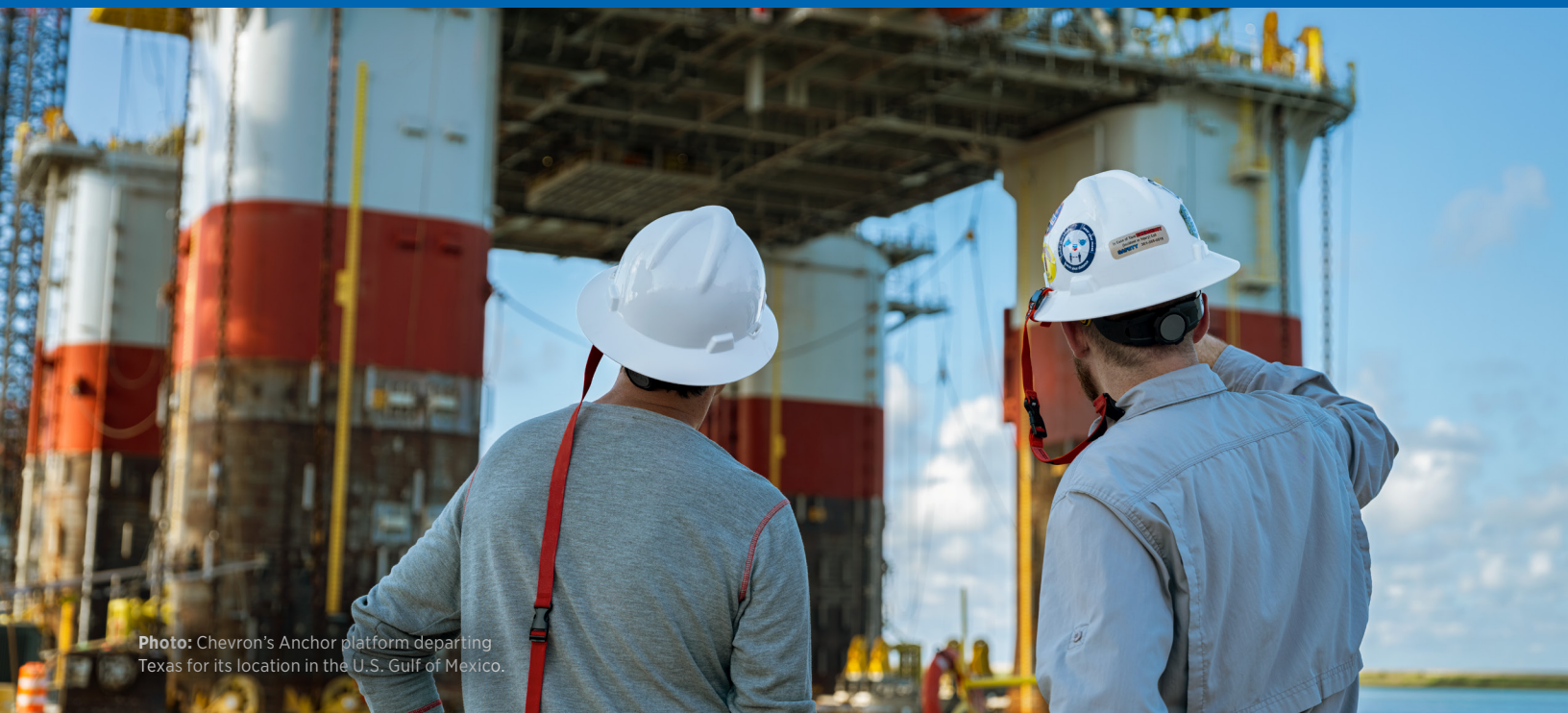
Photo: Chevron's Anchor platform departing Texas for its location in the U.S. Gulf of Mexico.

In approaching our tax obligations, we comply with the law, in line with our stringent global code of business ethics. We have zero tolerance for tax fraud and evasion.