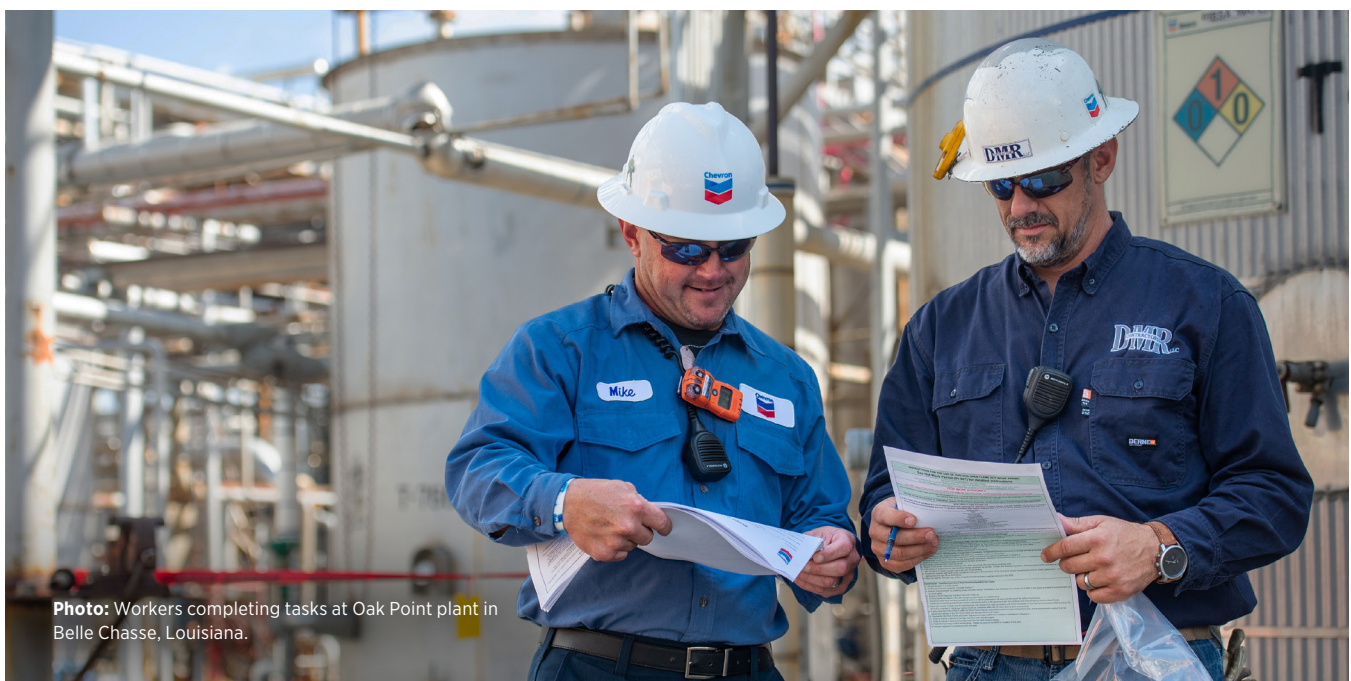
Photo: Workers completing tasks at Oak Point plant in Belle Chasse, Louisiana.

Chevron also engages with all levels of government in support of efficient, predictable tax regimes that encourage long-term investment and promote job and economic growth in the communities in which we operate. We have a long history of engagement and advocacy both directly and through industry and trade associations. Our engagements aim to deliver insight and recommendations on policy matters important to Chevron and support well-designed policies and rules that do not unfairly target our industry.