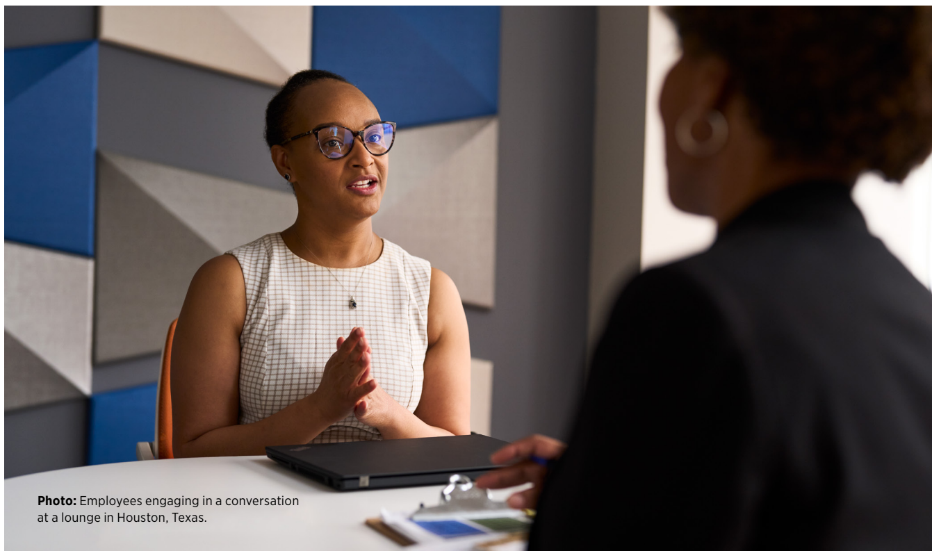
Photo: Employees engaging in a conversation at a lounge in Houston, Texas.

leadership team. The team is led by the Vice President and General Tax Counsel, with oversight by Chevron's internal audit function and ultimate oversight by the Audit Committee of our Board of Directors. The Audit Committee assists the Board in overseeing the audit and integrity of Chevron's financial statements. The Board's Public Policy and Sustainability Committee assists the Board in overseeing public policy issues relevant to Chevron and potential risks in areas, including sustainability. The Global Issues Committee, an executive-level committee, oversees Chevron's policies and positions on sustainability issues and practices, including revenue transparency.