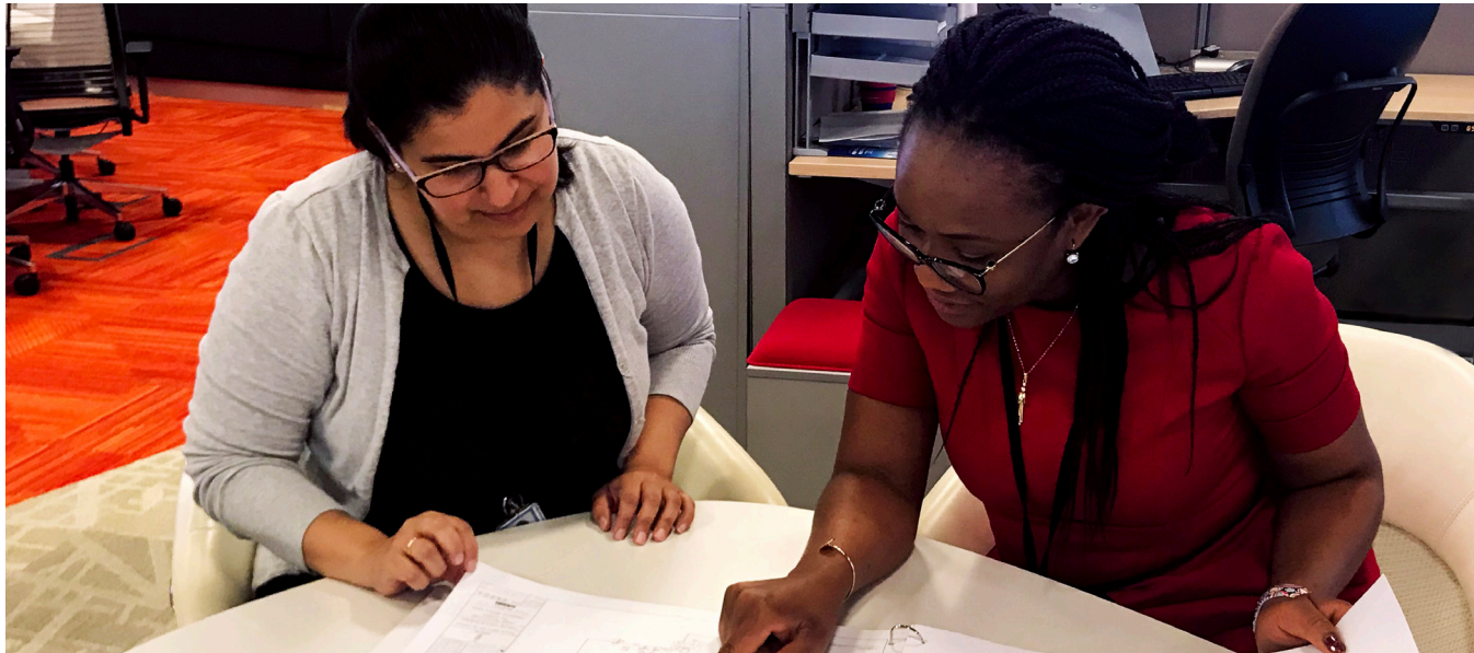
Engineers working in Chevron’s integrated Operations Centre in Aberdeen.

Chevron commenced its membership of BITC in 2019 and will support their gender equality campaign. This campaign aims to drive further opportunities for women in the workforce, improving recruitment and retention levels and, ultimately contributing to business success as a whole. Chevron’s membership is a sign of our commitment to responsible business practice, as well as allowing us to share some of the great work that we do and learn from BITC’s diverse network of 750 regional, national and international organisations.