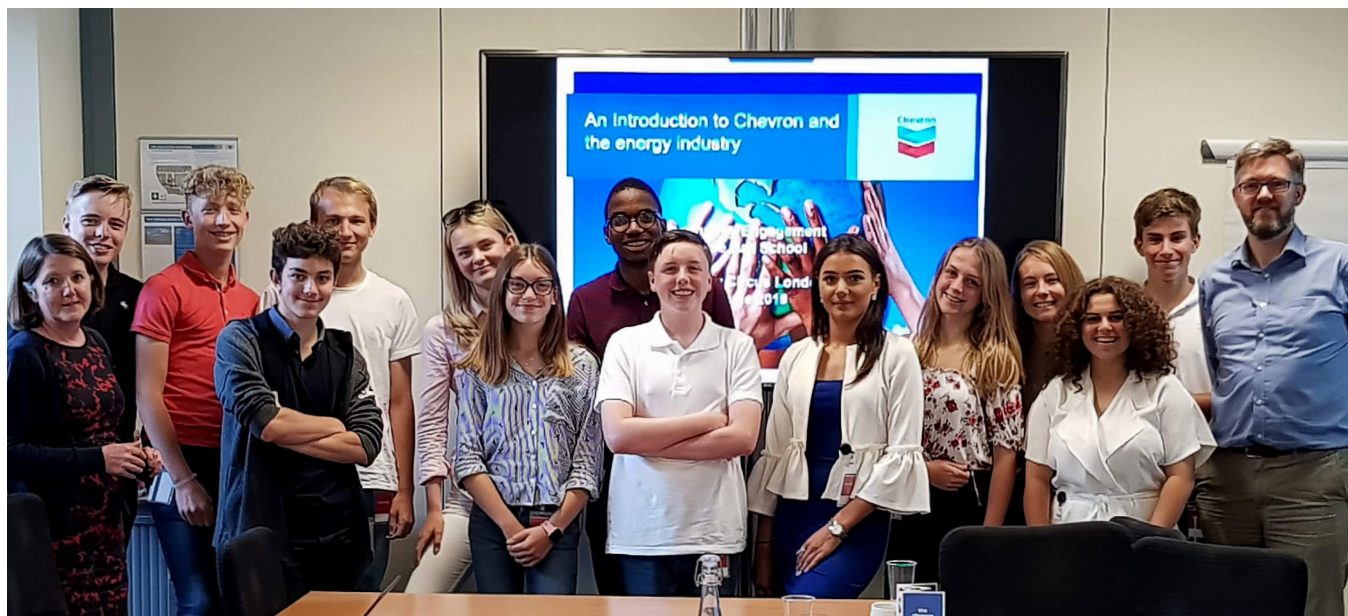
Pupils from Thorpe Hall School learn about careers in the energy industry.

Working with our global University Partnerships and Association Relations (UPAR) programme, we also provide scholarships, grants and contributions to help build tomorrow's energy workforce.